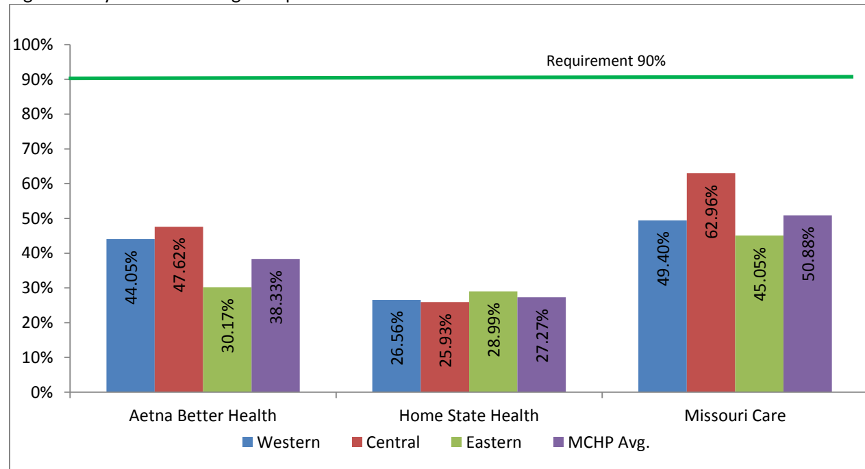
Figure 2: Psychiatrists taking new patients

When examining the survey questions individually, the widest range in level of accuracy exists in the areas that pertain to the providers who were taking new patients. The average number of Psychiatrists who were taking new patients new patients ranged from a high of 62.96% (Missouri Care - Central) to a low of 25.93% (Home State - Central).