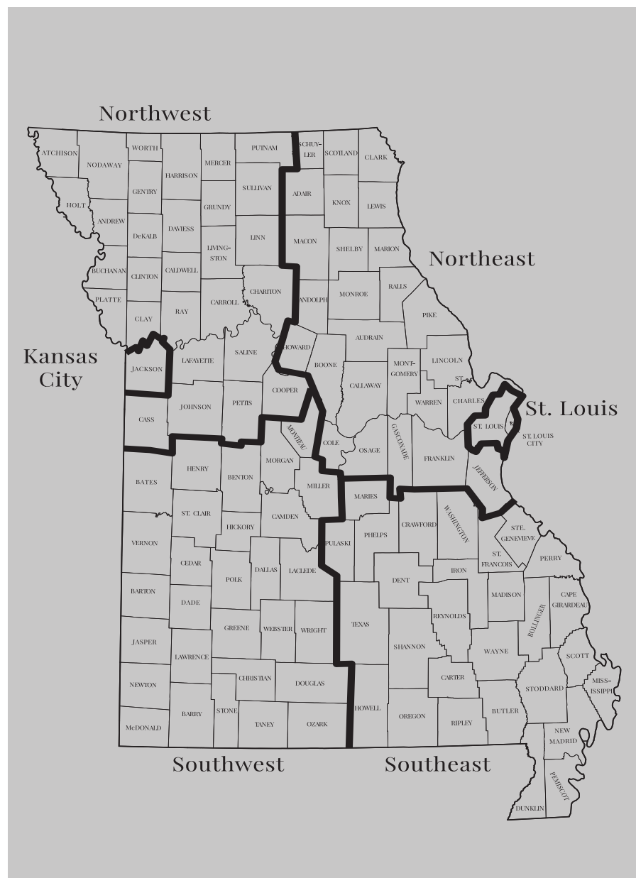
Map of Missouri State Foster Care and Adoption Board Regions

To review meeting notes visit dss.mo.gov/cd/fostercare/foster-care-adoption-board/