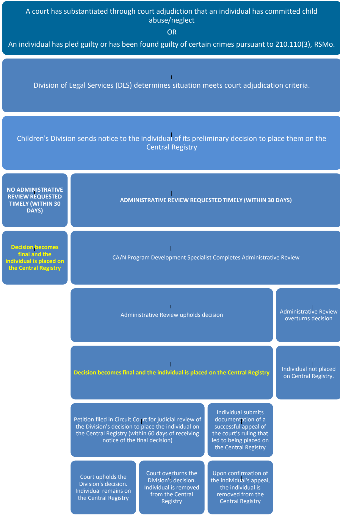
Flowchart #2: Central Registry for Court Adjudication without a CA/N Report