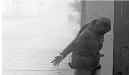
A woman struggles to make her way into the Hard Rock Hotel & Casino during heavy winds on Tuesday in Atlantic City, N.J.